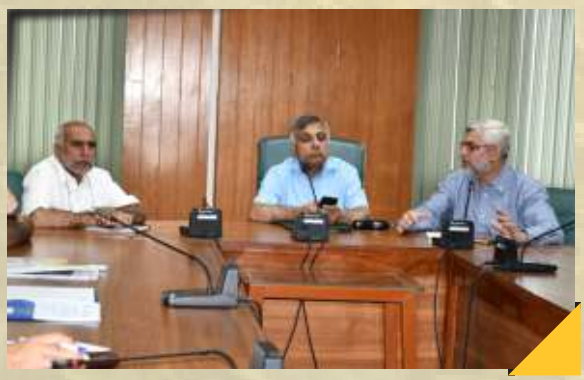
Exit meeting with Vice Chancellor PMAS Arid Agriculture University