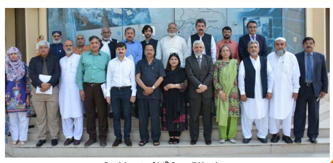
Participants of 14th Council Meeting