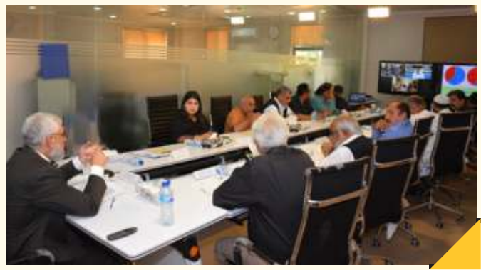
Glimpse of 14th Council Meeting