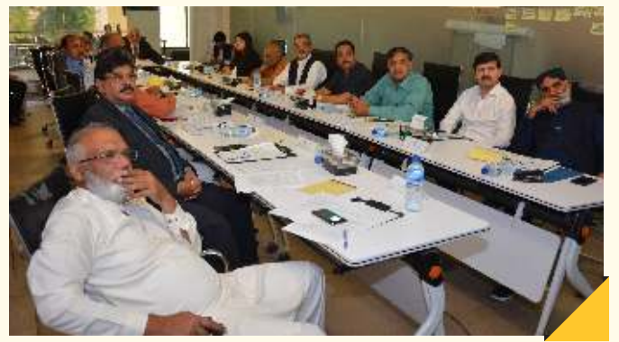
Glimpse of 14th Council Meeting