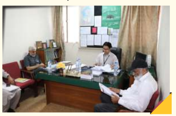
AIC Meeting at Department of Horticulture at The University of Poonch – Rawalakot