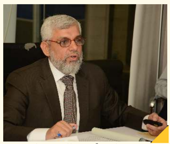
Chairperson addressing 14<sup>th</sup> Council meeting held on September 30,2019 at HEC